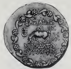
Lot No. 2129

KINGS OF PONTUS. Mithradates VI, 120-63 B.C. Tetradrachm, 89/8 B.C. Year 209. Diademed head r. with hair loose. Rv. Pegasos standing l. drinking; star and crescent to l., date and monogram to r.; all within ivy wreath. 16.774 grams. SNG von Aulock 7. Extremely Fine. (SEE COLOR PLATE)